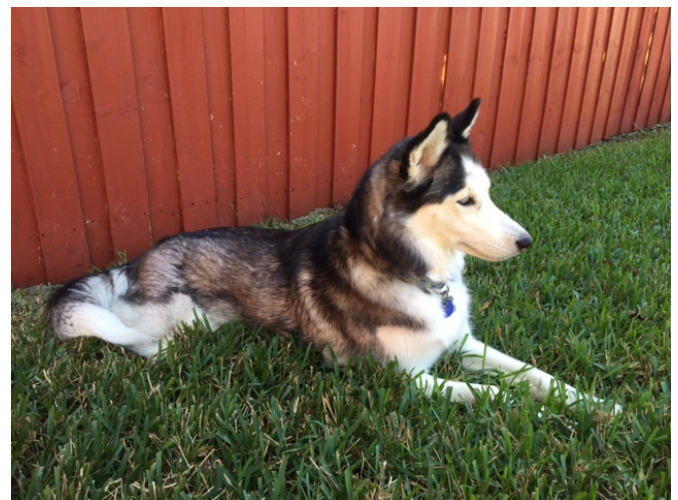
Talia 2 years old came into Rescue all skin/bones and with a dislocated hip a year ago.