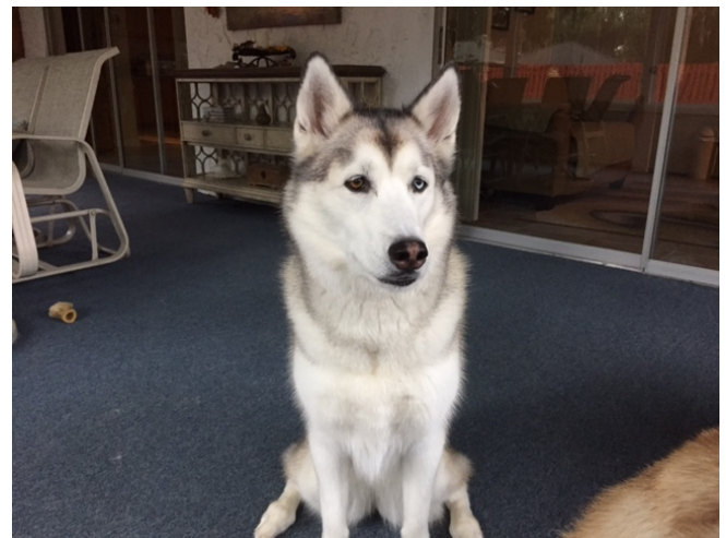
Rescue dog Juneau 8 yrs old