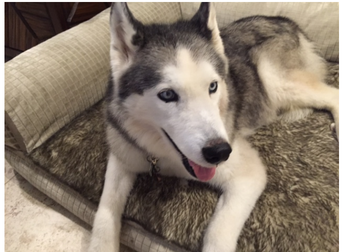
Faith at 12 1/2 yrs old just went to her new forever home